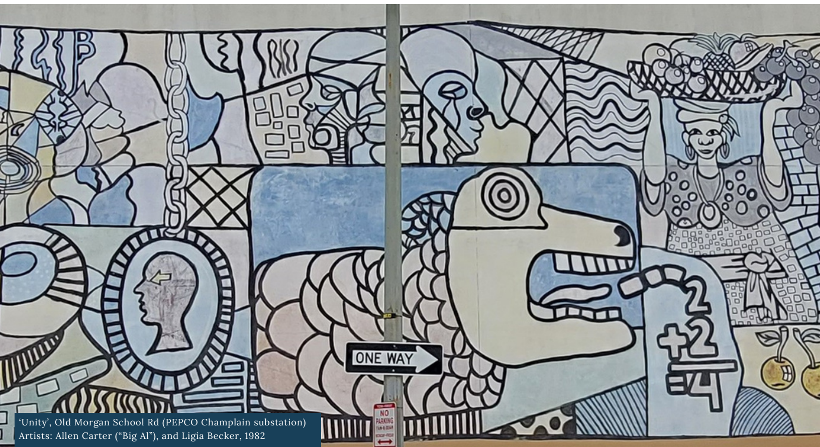
'Unity', Old Morgan School Rd (PEPCO Champlain substation) Artists: Allen Carter ("Big Al"), and Ligia Becker, 1982

Approved a resolution in favor of safer road infrastructure on 17th Street, NW that supported the expansion of the bike network in DC (September, 5-0).