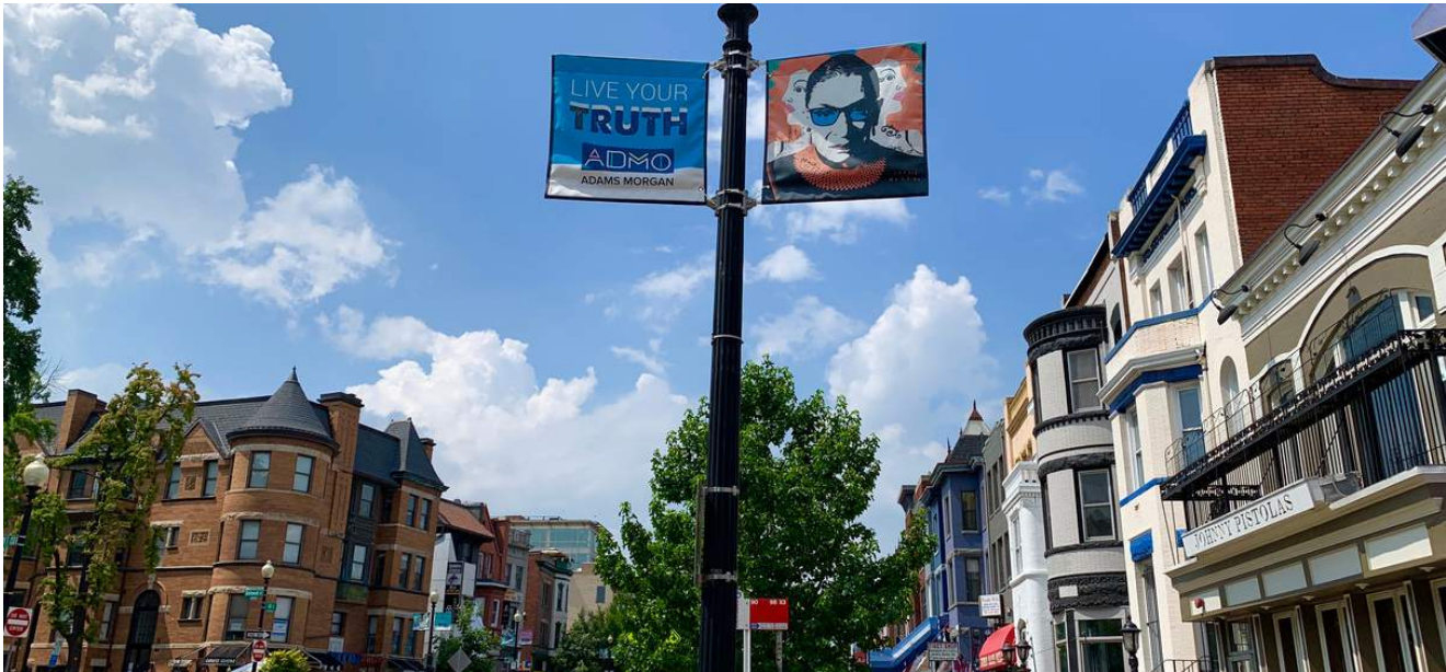
18th Street, NW

ANC 1C took the following actions related to transportation: