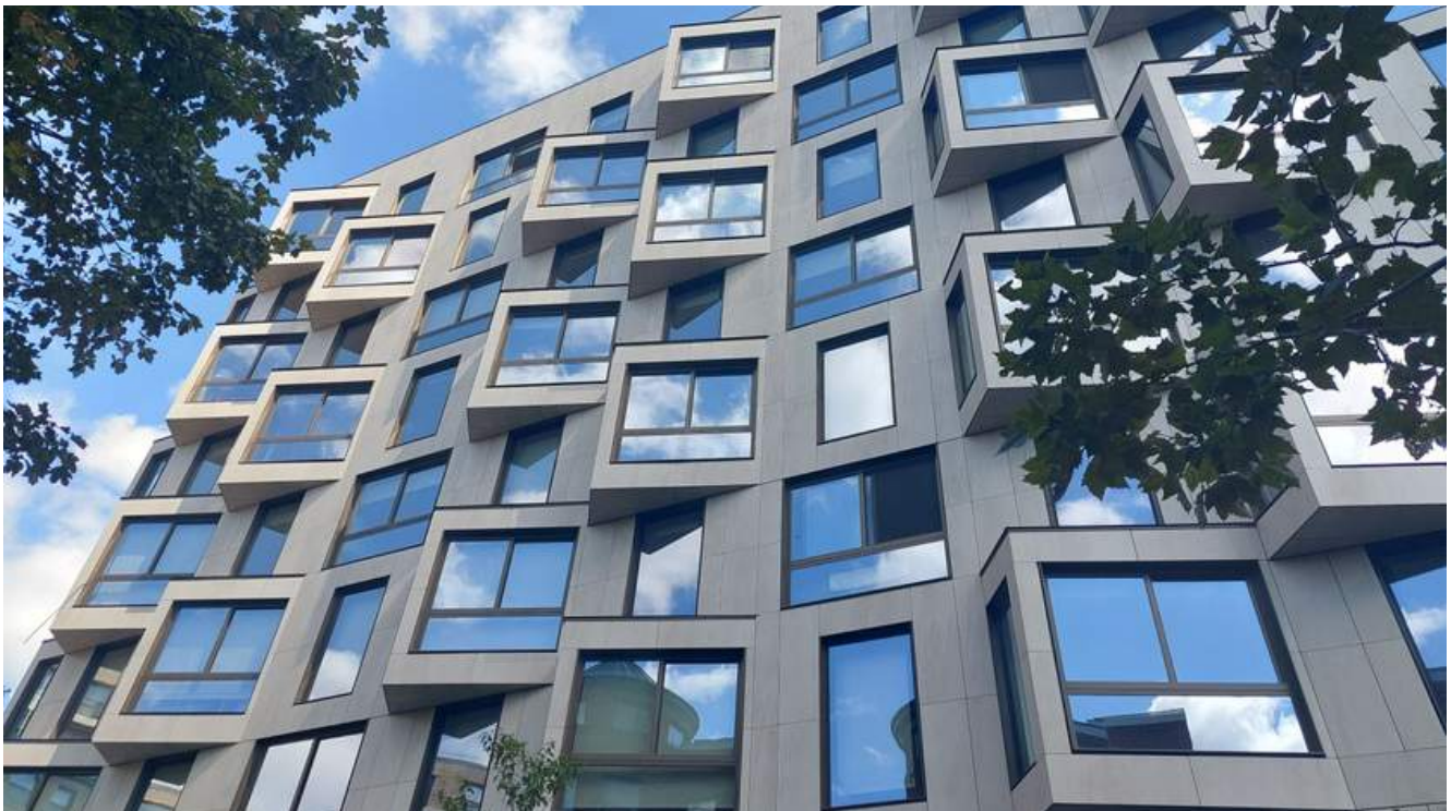
The Silva

Supported application for 2311 18th Street, NW , for historic preservation review. (November 7-0)