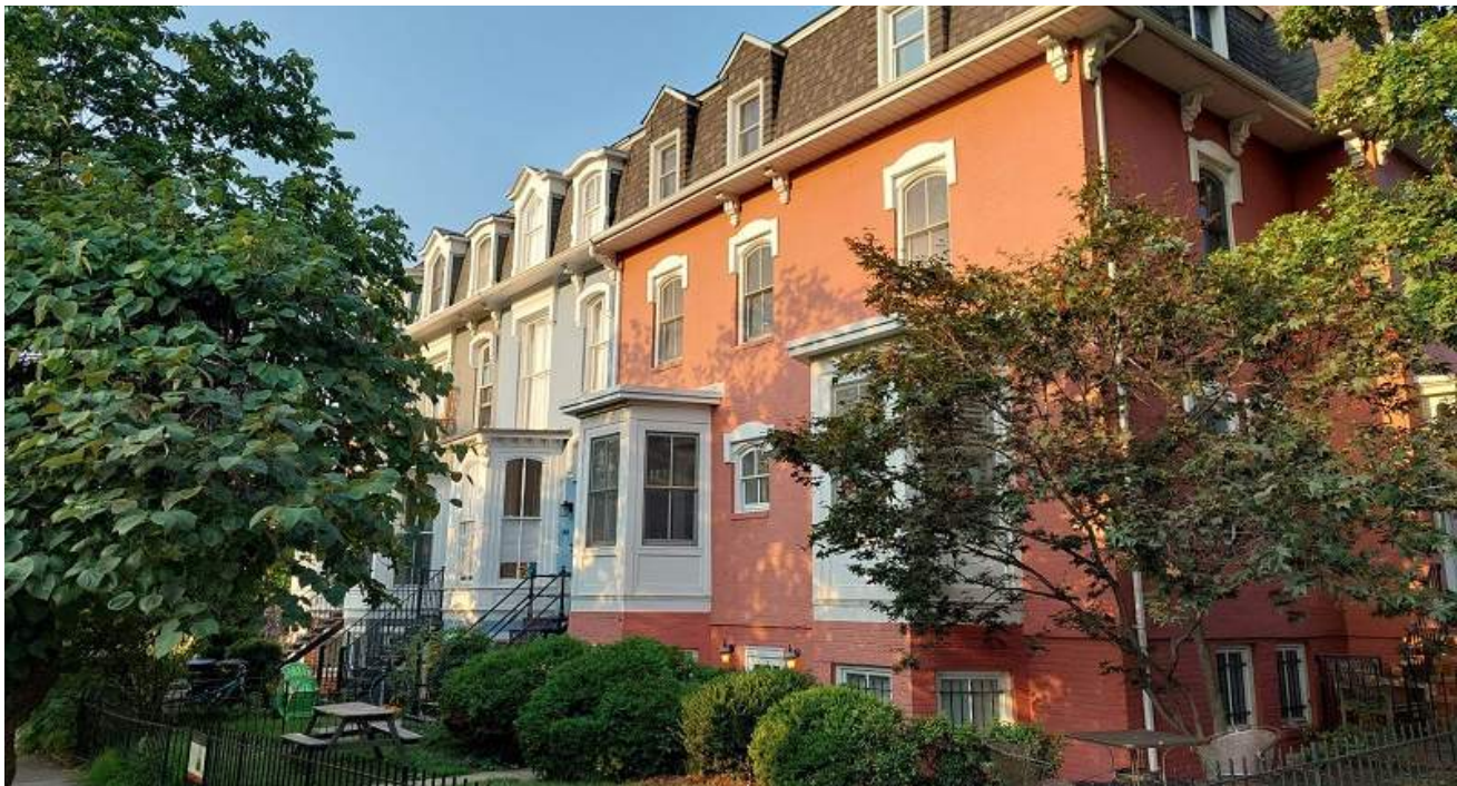
The Strivers' Section of Adams Morgan (Calvin T.S. Brent Residence)

Purchase of Service: Payment for accountant and A/V meeting services.