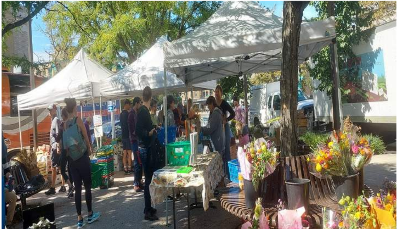
Adams Morgan Farmers Market