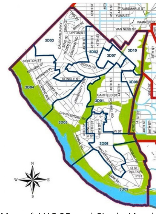
Map of ANC 3D and Single Member District Boundaries