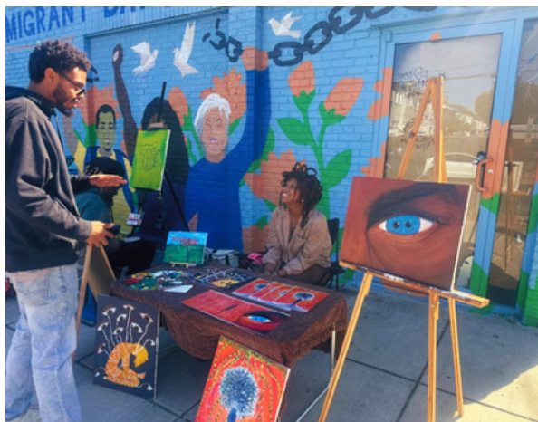
Local artists showcasing art on Kennedy Street

An evaluation of the program over the past three years yielded three important insights: 1) previous grant giving was centralized entirely in the Petworth portion of the Commission, with no grants distributed in support of programming benefiting the Brightwood Park section of ANC 4D; 2) there were few applications, resulting in fewer disbursements than ANC 4D's budget allows; 3) past ANC Treasurer compliance infractions generally stemmed from late receipts from previous grantees; and 4) portions of the existing guidelines were unclear or not followed in practice.