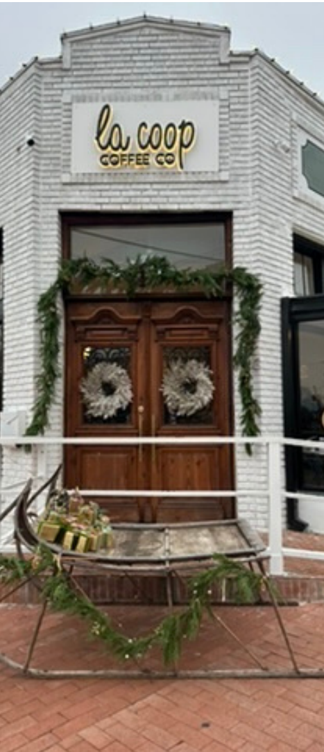
Kennedy Street's La Coop Coffee decorated with holiday cheer

Dear Residents, Neighbors, and Friends of the Brightwood Park and Petworth Communities,