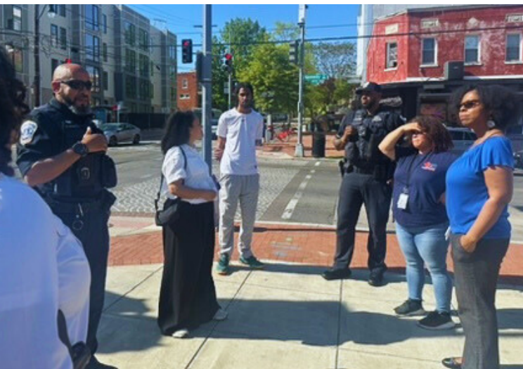
Residents gather for a community walk along Kennedy Street with MPD and agencies and organizations fostering a safer community.