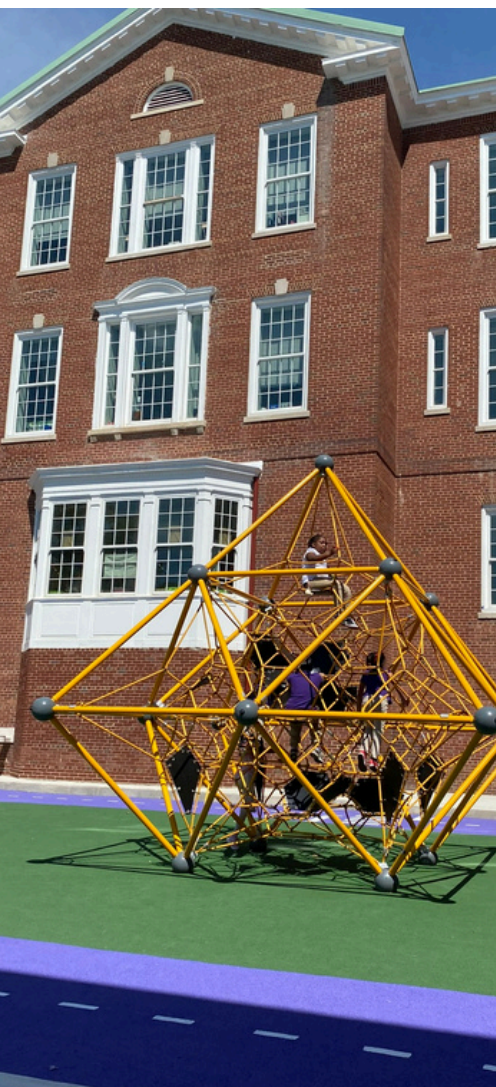
Truesdell Elementary's new playground after its modernization