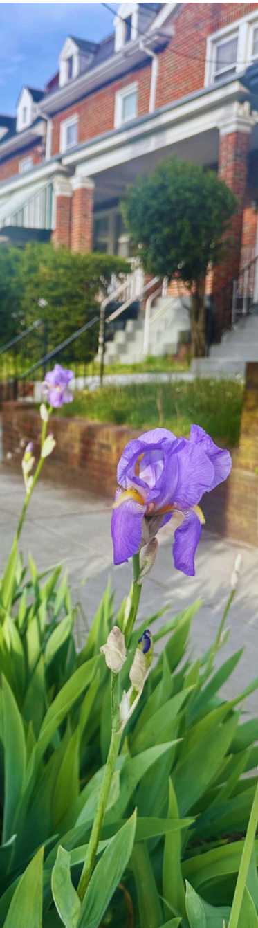
Springtime in ANC 4D